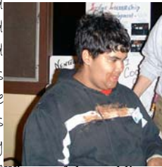
Winner of the pudding eating contest (above)

This past OA weekend was a work and fellowship weekend combined. Well it was supposed to be anyway but dedicated Nentego members worked hard all day in some cases to finish their projects. We had 41 Ordeal candidates and 4 elangomats. Friday night started off a bit rough when we faced some extenuating circumstances after a Ordeal candidate showed up late we did another Pre-Ordeal ceremony. Then at about 1 am we found out that a clan was missing. Well we found them 100 yards passed where they were supposed to be. It was generally smooth and well organized. Saturday proved productive. We had 4 Ordeal clans that worked on 7 projects. The clans worked on restoring dill hills on the roads that lead to Accomac and Shawnee/Minsi were reestablished and the sides of the main road were cleaned increasing the visibility. The Brotherhood worked on expanding the campfire ring and making the Chesapeake bay more